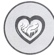
ANNIVERSARY CLUB ($65 - $364)

The California Scottish Rite Foundation has established the following 6 donation club tiers: Anniversary Club, 365 Club, Let's Talk Club, Chairman's Silver Club, Chairman's Gold Club, and Chairman's Diamond Club. The annual donation amounts are included with the symbols. All 6 symbols have a heart as the main feature. The heart symbolizes love and charity, which perfectly depicts our donor's generosity. Our monthly bulletin will now reflect these tiers. In addition, we are grateful for those who contribute through the Perfect Donor Program, which was established by the Scottish Rite Valley of San Diego. Those donors will continue to be recognized in the bulletin as well. Every donation makes a difference in the lives of children and families throughout San Diego. Thank you for your support of the RiteCare Childhood Language Center of San Diego!