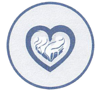
365 CLUB ($365 - $499)