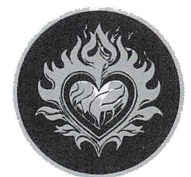
CHAIRMAN'S SILVER CLUB ($1,000 - $4,999)