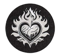
CHAIRMAN'S DIAMOND CLUB ($20,000+)