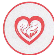
LET'S TALK CLUB ($500 - $999)