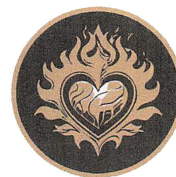
CHAIRMAN'S GOLD CLUB ($5,000 - $19,999)